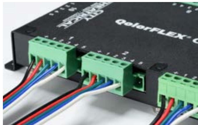
Other Phoenix terminal block connectors, such as five position, are also usable with QolorFLEX Connect 10.